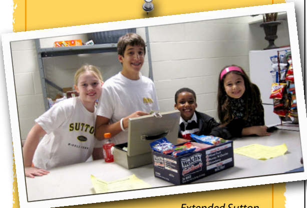
Extended Sutton family ready to serve you at Basketball concession stand!